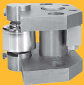
ADVANTAGE Series Load Point with C2 Calibration

Hardy carries a wide variety of strain gauge load points and scale bases to accommodate your application requirements.